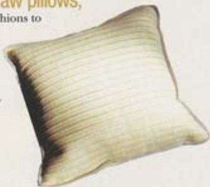
Above: A summery pillow from Baker. Below: Impervious to stains and mildew, indoor/outdoor Island Cloth from Scalamandré.